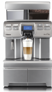
SAECO AULIKA TOP HIGH SPEED

Specifications: 1 kg coffee beans 4 l water 40 coffee grounds 1 l drip tray One-Touch / High Speed Cappuccino 2 coffee cups simultaneously Hot water / steam wand Double pump, double boiler Integrated Pinless Wonder Cappuccinatore Base for accessories and with extra capacity for coffee grounds Water supply connection (optional in Top version) Key locks Steel conical blades