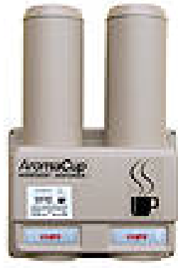
AC200C - DOUBLE CUP DISPENSER