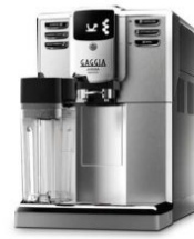
GAGGIA ANIMA PRESTIGE

The Gaggia “Soul” brings tradition and more than 75 years of experience combined in one coffee machine: Gaggia Anima. Takes home the mastery of a professional barista together with the innovation of a fully automatic machine, allowing you to re-discover the pleasure of the authentic Italian espresso at the touch of just one button. Thanks to the elegant design features with several steel details, Gaggia Anima is a treat for the palate as for the eyes, allowing you to create your own tailor-made coffee.