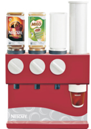
3 DISPENSER + CUP + TRAY