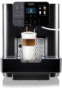
SAECO AREA OTC